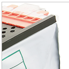
Tamper evident pouch