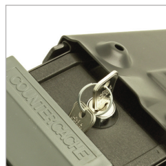
Secure locking system