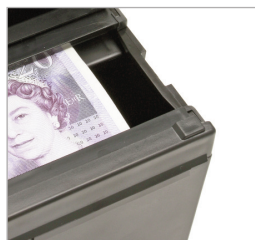
Perfect bill presentation

Protecting over a billion dollars every day