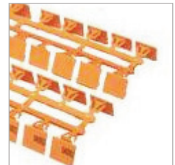
Numbered security seals