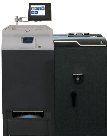
COMBINE THE RCS-400 2.2 WITH A NOTE UNIT AND EXPERIENCE COMPLETE CASH AUTOMATION

When the Till is inserted the dispense operation starts automatically by a sensor activation. This avoids the risk of having coins being dispensed inside the machine without the presence of a Till. The coins are dispensed parallel with the notes. When notes are ready and taken out of the RCS-700 the Till is ready to be taken out of its position and the cashier is ready to start working! When the RCS-400 2.2 is in deposit mode the Till compartment is closed and coins are available to be sent to transport box when needed.